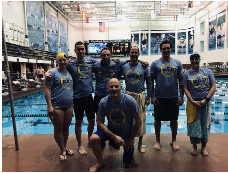
Saturday, March 23, First Timers