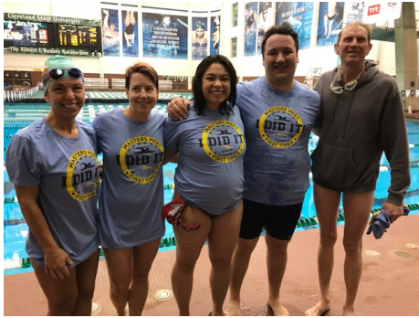
Sunday, March 24, First Timers