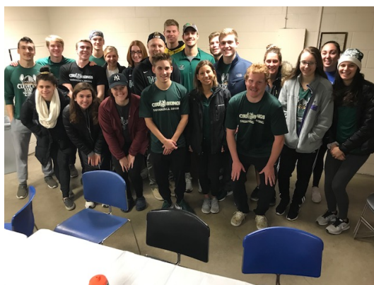
Cleveland State University Swim & Dive Team